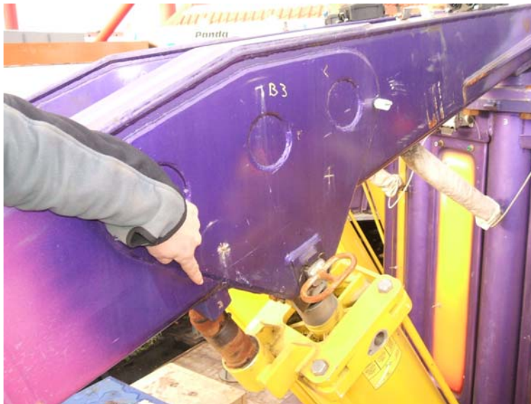
1.1 Location of defects in the radial arms.

The defects are located on the underside of the radial arms adjacent to the lifting cylinder attached damper unit. A block is welded to the radial arm that makes contact with the damper; the defects are located on the block to arm weldments. A modified block design has been supplied by SARTORI that has been subjected to a design review by ACG Engineering Ltd. This area is subjected to numerous stress reversals during one ride cycle and therefore needs regular monitoring.