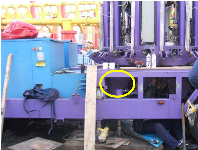
2. 1Location of cracking under the slew ring.

The cracking has occurred underneath the slew ring bearing as shown below. Sartori have been informed about the defect for which they provided a repair scheme. However, the cracking re-appeared within one season. It is considered necessary that an inspection of this area is included in the annual in-service inspection and the controller should also ensure that the trailer structure is included in the documented periodic checks.