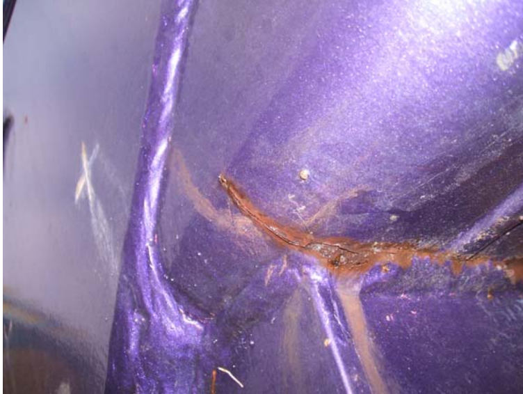
1.2 Typical example of a defect in the affected area.