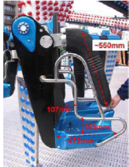
ReMix II (4 arm)

These side bar additions are to be welded into position On the outside bars either using TIG or MIG welding procedures. Welding should be completed by a certified welding technician with experience in welding stainless steel. All welds are to be cleaned and polished, removing all sharp edges when completed.