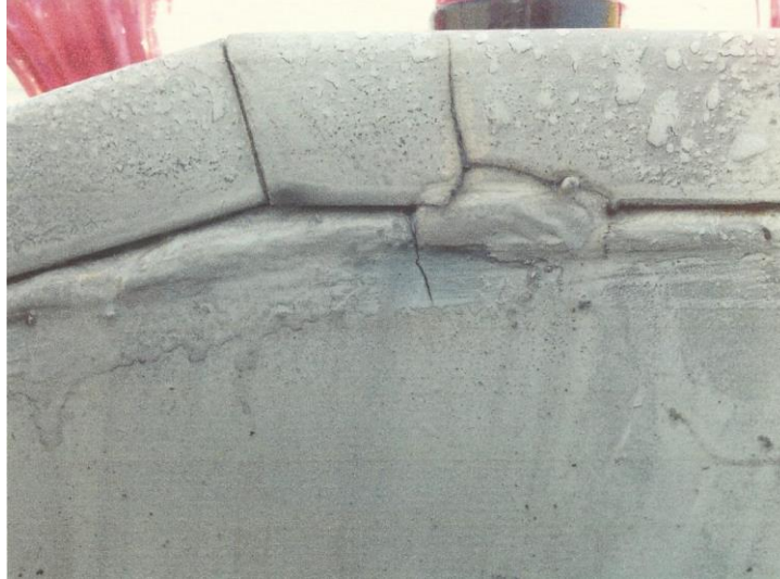
Photograph showing the cracking, initiated from the tack weld used to attach the lighting conduit

In 2009 there was an incident involving a Safeco Crazy Frog in which one of the radial arms failed during operation. This machine was manufactured in 2004 and the failure, due to a similar crack forming, occurred at a different location on the arm. In both cases it appears that the cracks initiated from a tack weld to the lighting bars.