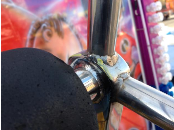
3) weld defect lap bar control arm right hand side, protective padding is required to be partially removed for access.