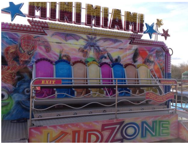
1) general overview of device.

For your information, defects as below found on a number of mini Miami rides , manufacture ; danum uk / f stokes.