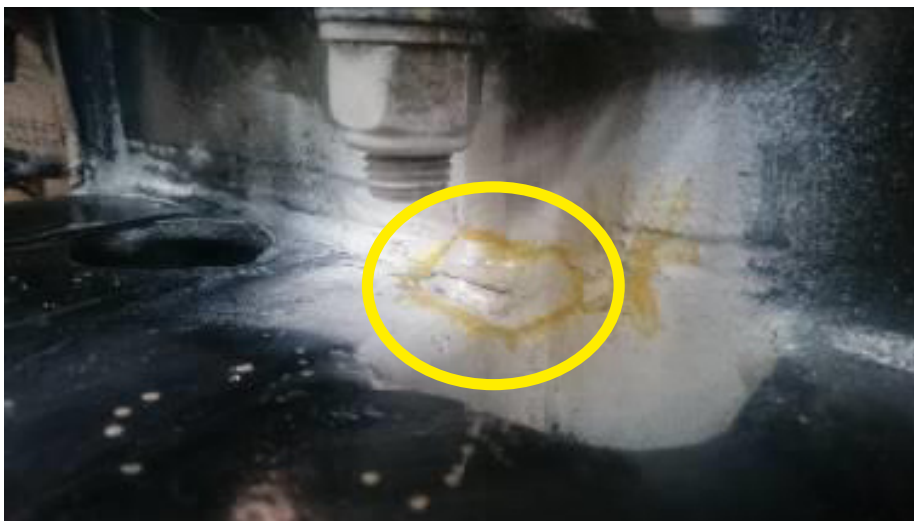
▲ Strengthening gusset cracking below seat