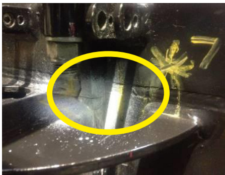
▲ Strengthening gusset cracking below seat