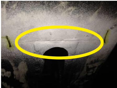
▲ Drive plate area