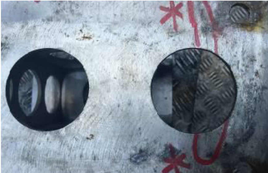
▲ Cracking on the rear of the bracket found visually