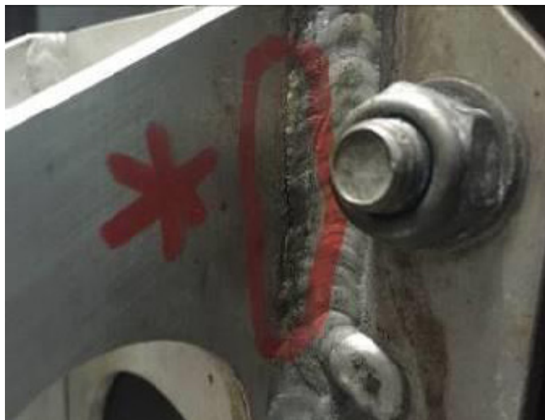
▲ Cracking on a vertical weld – found by DPI