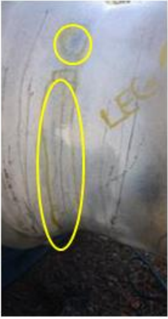
Lower support leg bore circ welds cracking (visual & mpi)