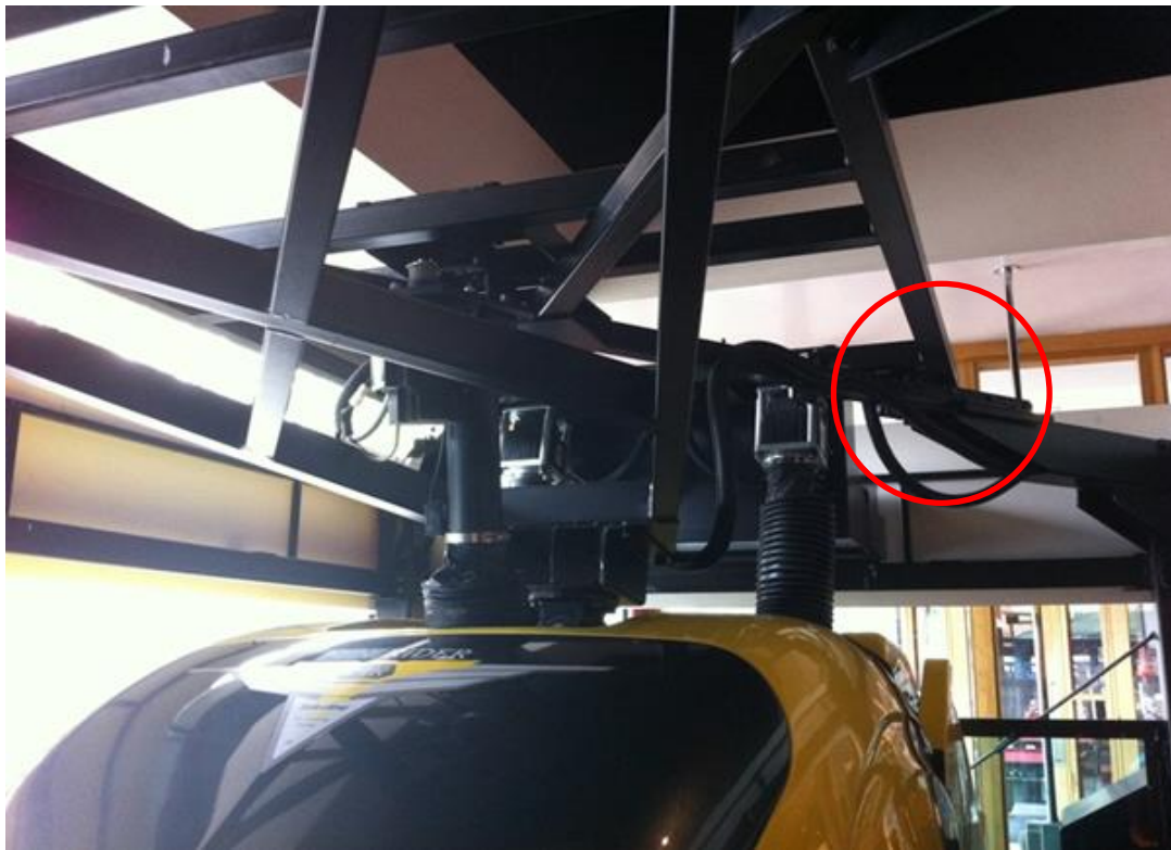
Photo shows the general location of the cracking on the main support frame.

Controllers and inspection bodies should pay particularly close attention to these areas when carrying out maintenance checks and inspections.