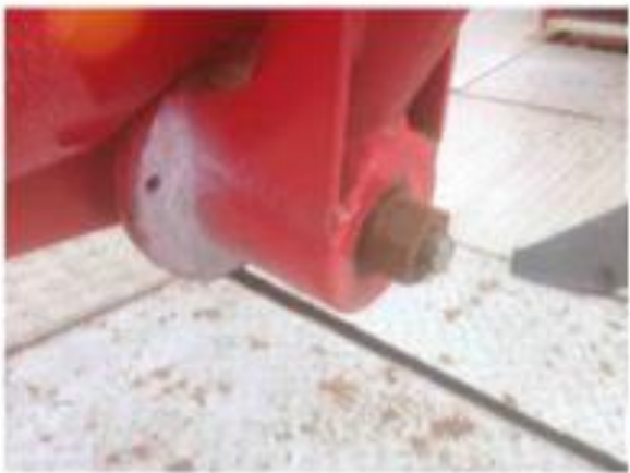
General image of component when assembled